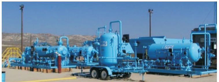
2,500bopd Ultra Early Production Facility - Options to Lease or Buy

Peso Energy Services, realizing the limited cash available to operators to develop their fields, can assemble early production facilities from her huge inventory of used production & processing equipment specially sourced over the years for this purpose. Separators, thermal treaters, wash tanks, fuel gas scrubbers, flare systems can be assembled to commence production within the shortest possible time.