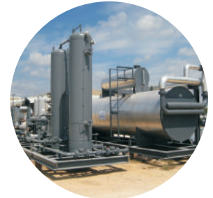
Modularize Condensate stabilization system